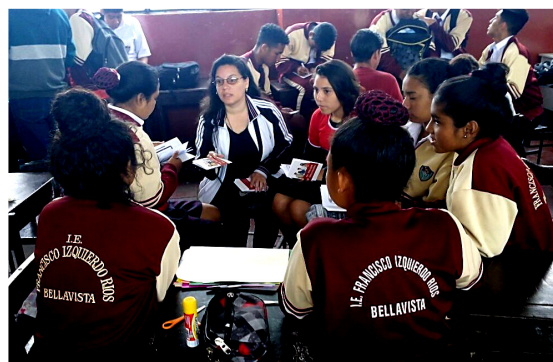
SHARING CHRIST'S SALVATION CLEARLY

IT ENCOMPASSES THREE DISTINCT ENVIRONMENTS RUNNING NORTH TO SOUTH FOR 1,300 MILES. COASTAL LANDS WHERE MOST OF THE POPULATION LIVE ARE DESERT. THE HIGHEST PART OF THE ANDES MOUNTAIN CHAIN FORMS THE COUNTRY'S 'SPINE,' AND AN EXPANSE OF JUNGLE TO THE EAST EMBRACES THE HEADWATERS OF THE AMAZON RIVER WHICH RUNS EAST ACROSS THE ENTIRE CONTINENT OF SOUTH AMERICA.