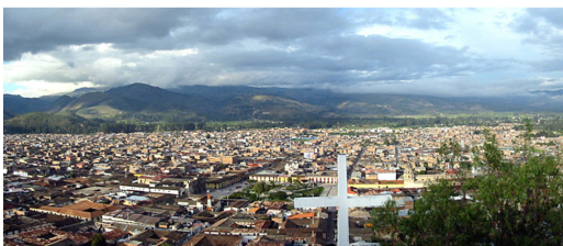
CAJAMARCA, PERU SPREADS TOWARD THE MOUNTAINS