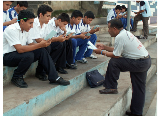
YOUNG MEN LEARN THE TRUE MEANING OF THE GOSPEL

Praise God for opening the hearts of both students and teachers, and for giving spiritual gifts to our team members to speak into their lives and to show them the way of salvation in Christ.